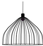
shade medium copper